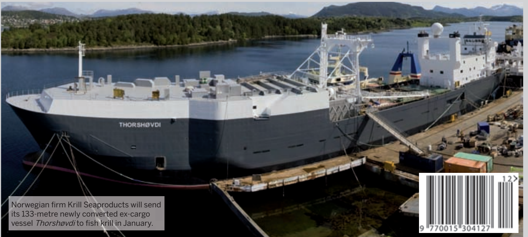
Norwegian firm Krill Seaproducts will send its 133-metre newly converted ex-cargo vessel Thorshøvdi to fish krill in January.

– as new ships pump up the volume. Pages 14-17